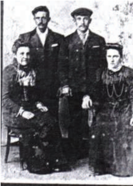
Group at East Coast Fishing Port.