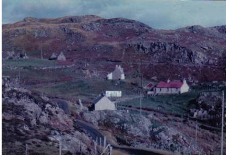
A view of Calbost from Croft 14 as the road goes out towards Gravir, circa. 1975.

In the forefront may be seen the village prayer house as it was refurbished about 1972.